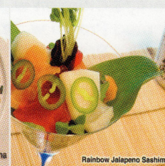
Rainbow Jalapeno Sashimi