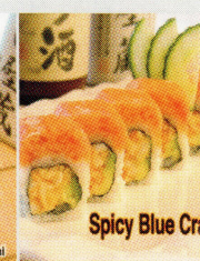
Spicy Blue Crab Roll