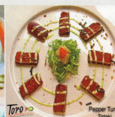
Pepper Tuna Tataki