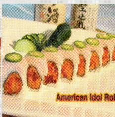
American Idol Roll